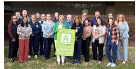
Leaders of the hospital gathered in celebration of the Fall Leapfrog A recognition.