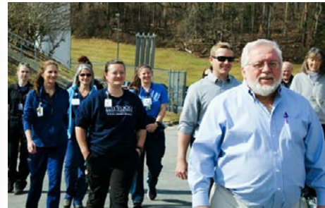
Hospital team members led Heart Hustle during the Haywood Heart Expo event.