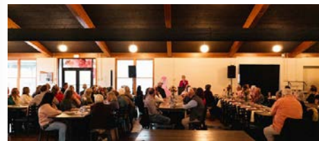
Haywood Regional Medical Center hosted the "Radiant Resilience" dinner for breast cancer survivors.