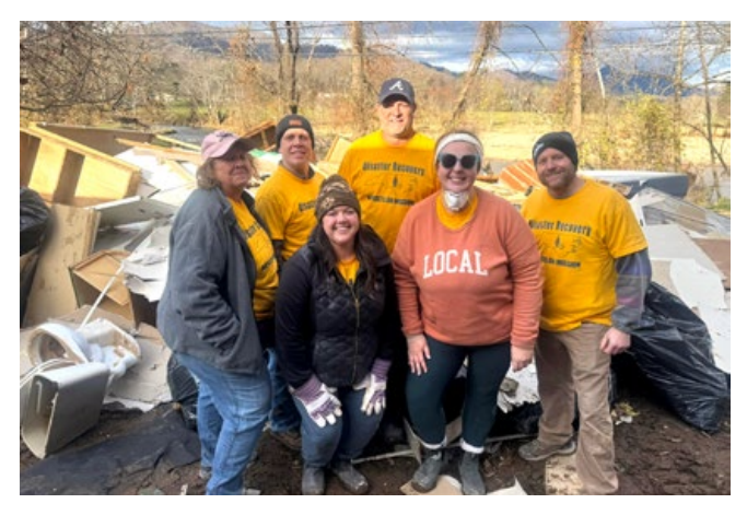
Leaders from the HRMC Give Back Team partnered with NC Baptists on Mission to assist with gutting a flood-ruined trailer just miles from the hospital after Hurricane Helene.